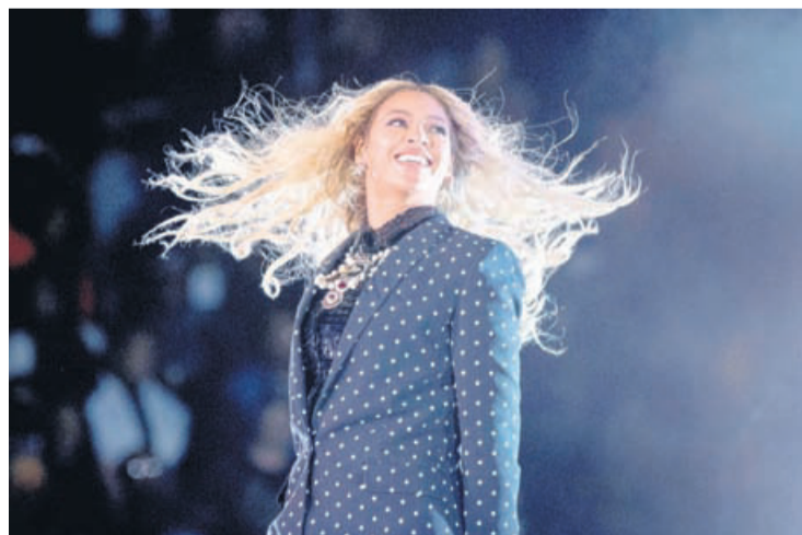
Beyoncé performs at the Wolstein Center, Nov. 4, 2016, in Cleveland, Ohio.

Taylor Swift leads the nominations with nine, followed closely by Jelly Roll, SZA, and 21 Savage with eight. Behind them is Olivia Rodrigo, who received seven. Fans can vote in several categories including best lyrics, best music video, best fan army, social star award, favorite tour photographer, TikTok bop of the year, favorite tour style and two new fields: favorite on screen and favorite debut album. □